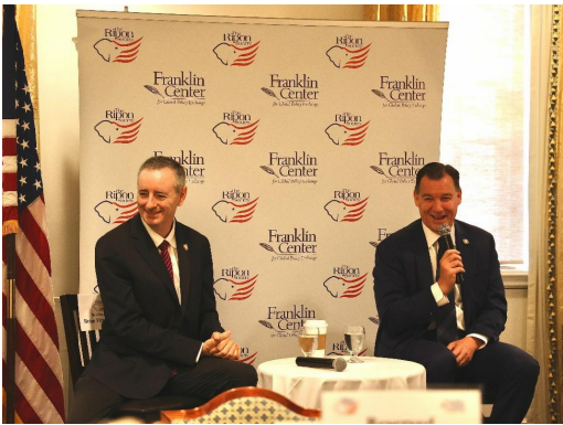
Problem Solvers Co-Chairs Fitzpatrick & Suozzi Work to Bridge Partisan Divide June 25