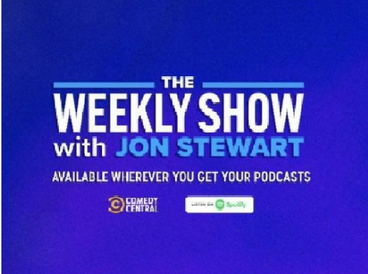
Problem Solvers Caucus Co-Chairs join The Weekly Show with Jon Stewart May 8