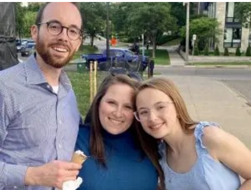
Momentum Builds for New ADINA Bill to Label Allergens in Drugs June 11