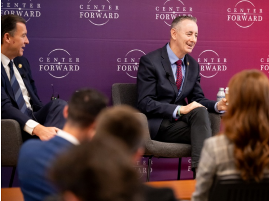
Center Forward and the Problem Solvers Caucus Highlight Importance of Relationships Across the Aisle April 28