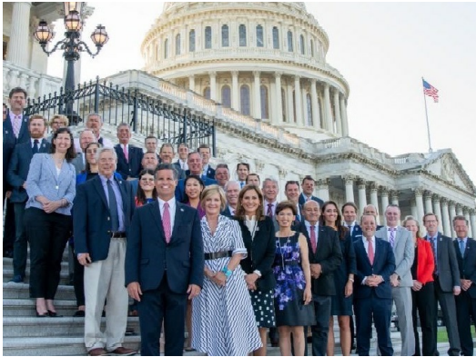
The fate of Trump's agenda rests with the House GOP's 'five families' May 20