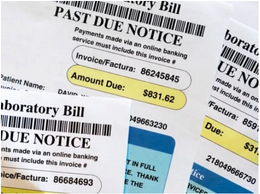
America Has a Health Care Affordability Gap. Congress is Working Toward Change. June 4